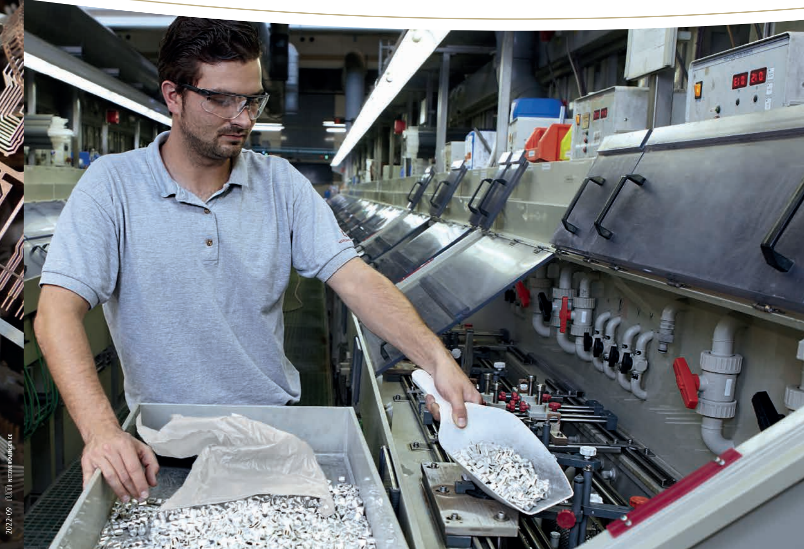
2022-09 © Umicore AG/Agosi NETZWERKVERBUND.DE

AgosiRefining At Agosi, your material is in good hands Our recycling management returns your scrap material to the cycle of your precious metals. We process the material for you cost-effectively using state-of-the-art processes. You receive the value in the form you prefer: as fine metal or semi-finished products, as credit on your precious metals weight account, or as the equivalent in cash transferred to your bank account. Agosi thereby completes the cycle with a fully comprehensive service package: we offer all services for the entire cycle of precious metals - a reliable single source.